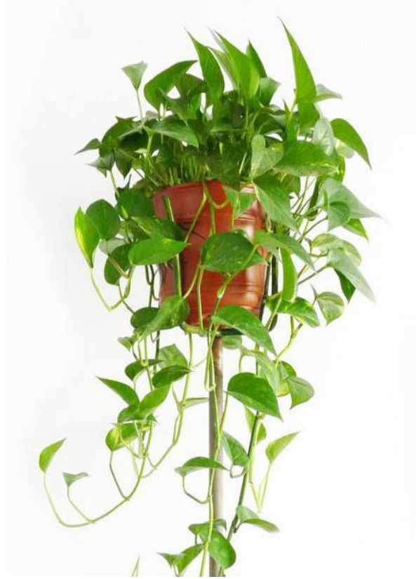
Green trailing plant